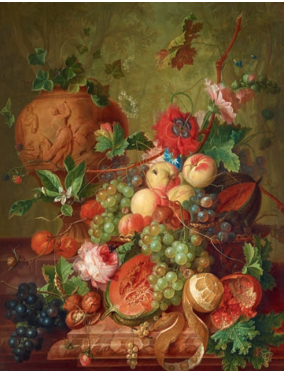
FLOWER STILL LIFE / FRUIT STILL LIFE PAIR OF PAINTINGS OIL ON PANEL, 72.4 x 57.9 CM AND 73.3 x 58.1 CM ESTIMATE: € 800,000 – 900,000