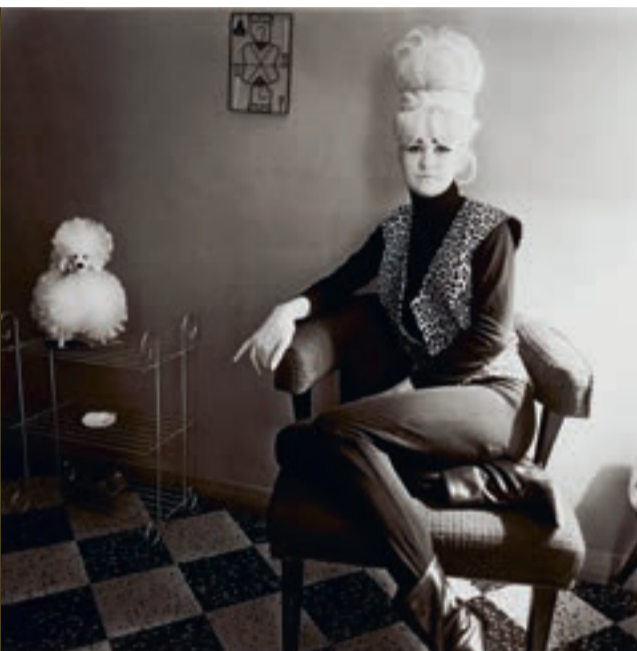
DIANE ARBUS LADY BARTENDER AT HOME WITH A SOUVENIR DOG, NEW ORLEANS, LA. 1964 GELATIN SILVER PRINT ON AGFA PAPER, PRINTED LATER BY NEIL SELKIRK, 36.4 x 36.5 CM (50.2 x 40.4 CM) ESTIMATE: € 12,000 – 15,000