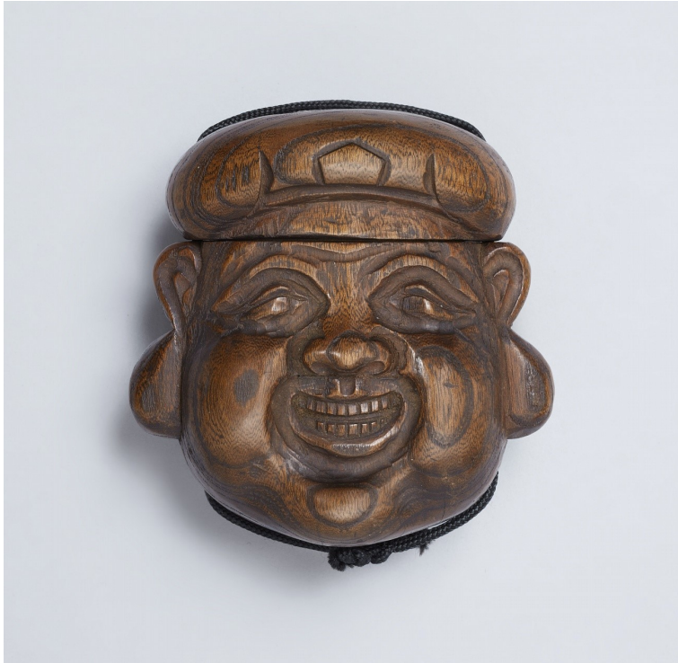
Lot 173 A WOOD TONKOTSU. LATE 19TH/EARLY 20TH CENTURY

In the shape of a face, on one side that of Daikoku, on the other that of Ebisu. Height 10 cm