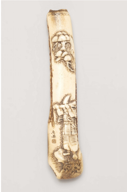
Lot 144 A STAG ANTLER KISERUZUTSU. 19TH CENTURY