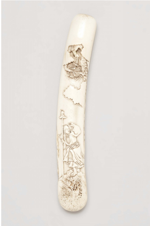
Lot 160 A STAG ANTLER KISERUZUTSU. LATE 19TH CENTURY

Of otoshizutsu type, with Yoshitsune with a halberd standing beneath a pine tree. Length 19.6 cm