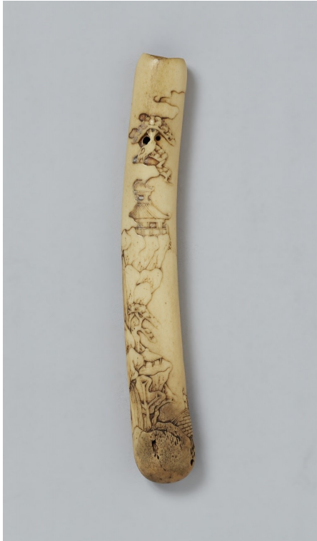
Lot 148 A STAG ANTLER KISERUZUTSU. 19TH CENTURY

Of otoshizutsu type, carved in relief with two persons crossing a stone bridge in front of an impressive rock face with buildings, pine trees and a cascade. The himotoshi formed by a pine tree's protruding stem.