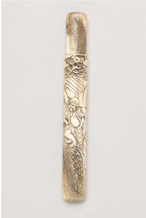
Lot 158 A KISERUZUTSU. LATE 19TH CENTURY

Of musozutsu type, carved from bone in relief with Benkei carrying the bell of Miidera up to Mount Hiei. Length 21.7 cm