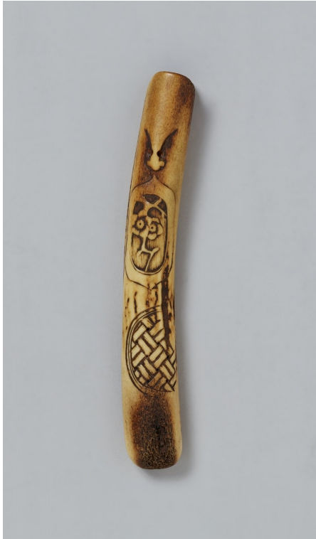
Lot 146 A STAG ANTLER KISERUZUTSU. 19TH CENTURY

Of warizutsu type, carved with panels of various shapes, those to the front with plum blossoms and a rattan pattern, the reverse with two fan-shaped motives. The upper one incised, the lower one carved as an opening. Length 18.6 cm