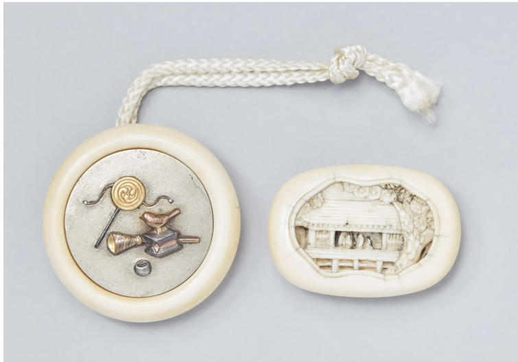
Lot 121 ‡ TWO NETSUKE. LATE 19TH CENTURY