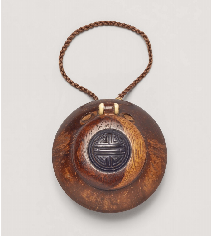
Lot 170 ‡ A WOOD AND IVORY TONKOTSU. 19TH CENTURY

Of circular shape, with a central hinged lid inlaid with an ebony wood kotobuki symbol. Hinges and himotoshi linings of bone.