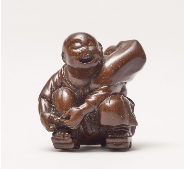
Lot 66 A FINE WOOD NETSUKE OF A BIWA HOSHI. MID-19TH CENTURY

The blind musician squatting and grasping the torn thongs of his geta wearing a wrapped biwa on his back.