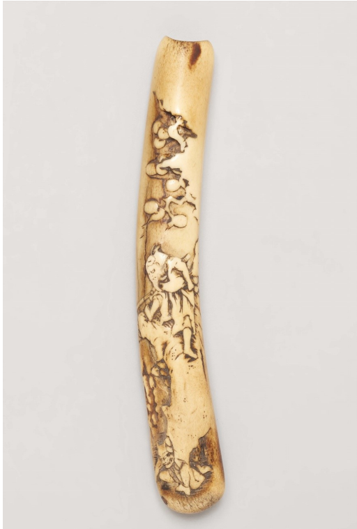
Lot 145 A STAG ANTLER KISERUZUTSU. 19TH CENTURY

Of otoshizutsu type, carved with Shoki standing on a rock and looking down in search for a hiding oni. Traces of use and age cracks. Length 21.4 cm