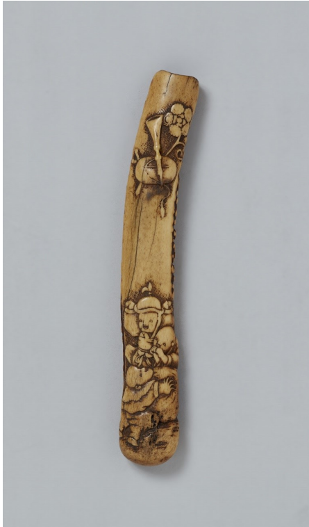
Lot 150 A STAG ANTLER KISEURZUTSU. 19TH CENTURY

Of otoshizutsu type, carved with three karako playing around a rock. The himotoshi formed by a shawm.