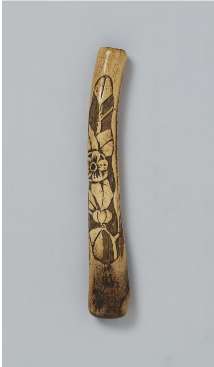
Lot 149 A STAG ANTLER KISERUZUTSU. 19TH CENTURY

Of otoshizutsu type, carved with a blossoming plum branch in an irregular reserve. Length 20.2 cm