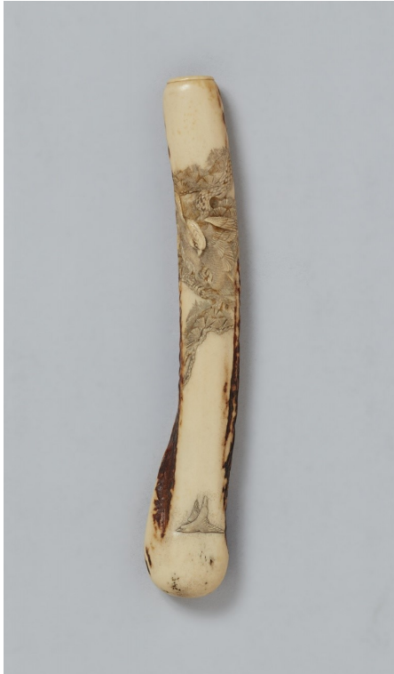
Lot 147 A STAG ANTLER KISERUZUTSU. 19TH CENTURY

Of otoshizutsu type, carved in high relief with an eagle sitting on a pine branch and spotting his prey flying by. Length 19.4 cm