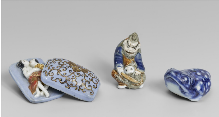
Lot 57 THREE PORCELAIN NETSUKE. 19TH CENTURY

a) Hako netsuke, the lid decorated with a kiri mon amidst tendrils in gold lacquer, inside a loving couple, b) Shoki with a moveable tongue fighting an oni, Hirado, and c) a stylised three-legged toad, possibly Hirado. (3)